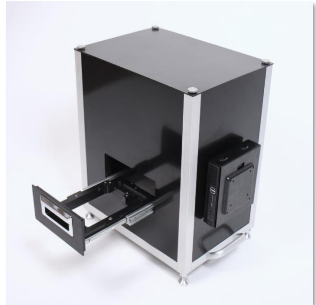
SENTRY overview: Front side

Checking the dimensional accuracy of a DUT (housing correctly inserted, PCB completely cleanly separated from the panel)